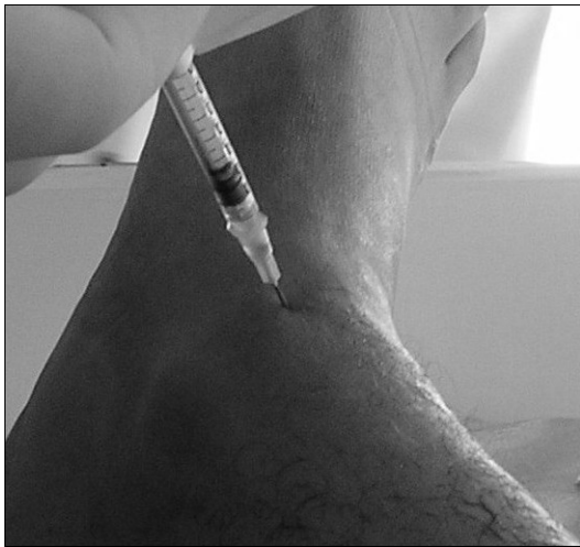
Figure 2. Ankle radioactive synoviorthesis with Rhenium-186 for recurrent hemarthroses. The entry point is between the medial malleolus and the tibialis anterior tendon.

practical reality is that it is necessary to organize groups of patients (e.g. six to eight) to be injected. This means that the first patients of each group could possibly wait from three to six months until the group is complete. In such cases, patients should be in prophylactic hematologic management while waiting. Good coordination between the members of the hemophilia centre, the department of radioactive isotopes, and the enterprises that produce the radioactive material is paramount.